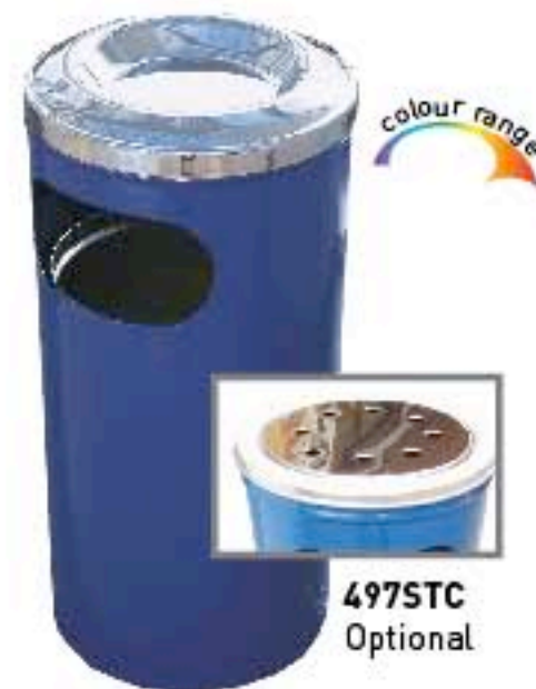
497STR Ash/litter bin Powder coated Zintec steel body. Lift-off polished stainless steel top with ashtray recess. Two large litter opening. Galvanised liner included. D: 360 x H: 720mm Capacity: 37 litres