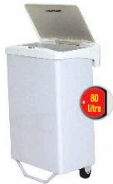
DZTB Sensor Handsfree Powder coated white Mains and battery powered, long life/low energy consumption. 5 year warranty Dimensions Open: H: 800 x W: 400 x D: 260mm

The RGF model is fully fire retardant and conforms to hospital design regulations. All white will be supplied unless otherwise stated. Other lid colours can be supplied: yellow, black, brown and blue.