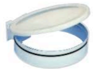
483 Open sack holder Powder coated steel with elasticated sack retention cord. Stock colour - white D: 350mm