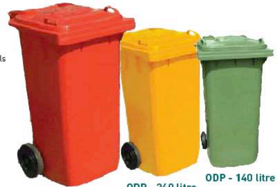
ODP - 360 litre