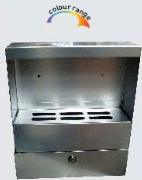
SL100 W: 280 x D: 85 x H: 350mm

'Linpure' external wall mounted cigarette disposal bins Manufactured from Zintec steel and epoxy powder coated. Integral collection box fitted to the door - cannot get lost. Universal key fits all units. Supplied with fixing kit self adhesive sign to fit on door. LP100-06 & LP104 are available from stock on a next working day delivery. Can be supplied in other colours to order.