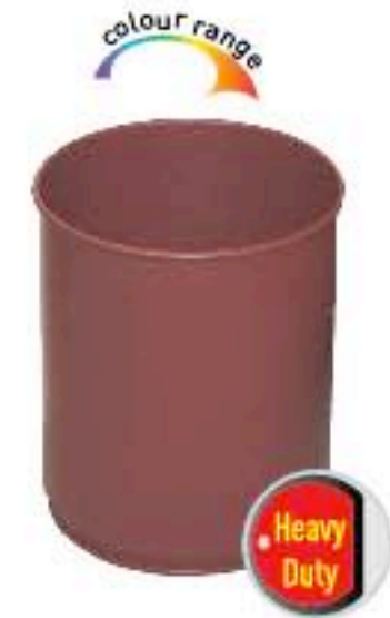
520 (pack of 4) Powder coated textured colours see right. D: 235 x H: 275mm Capacity: 12 litres

◀ Model 520 is available in a choice of 5 hard wearing powder coated textured finishes. These, easy to clean surfaces, give the look of grained vinyl at much lower cost.