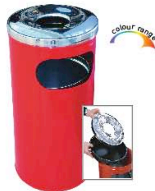
497STF Ash/litter bin Powder coated Zintec steel body. Ashtray top assembly incorporating a black metal bowl with stainless steel top. Two large litter opening. Galvanised liner included. D: 360 x H: 720mm Capacity: 37 litres