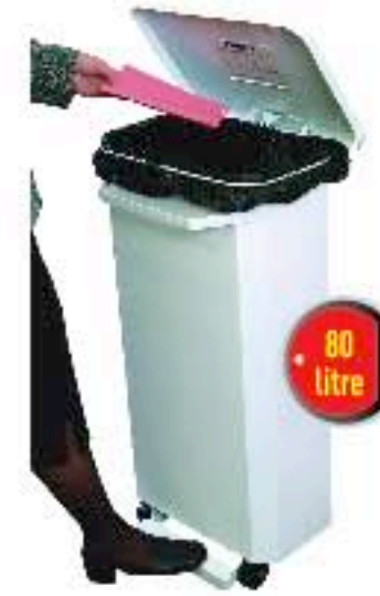
5350 Enclosed sack holder Powder coated steel with elasticated sack retention cord. Stock colour - white. W: 430 x D: 300 x H: 860mm