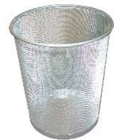
WLB290 (pack of 12) Silver powder coated steel mesh with solid base and rolled top edge. Top D: 290 x H: 340mm Capacity: 18 litres