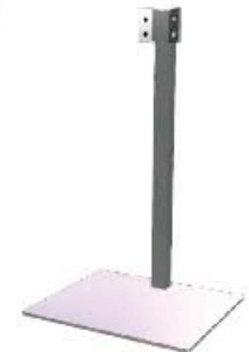
FSSB - Free Standing Single Bracket Floor mounted bolts included W: 300mm x H: 1m