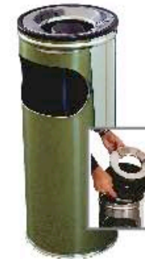
487HSS ash/litter bin Bright polished stainless steel body. Black metal ashtray bowl with stainless steel insert. Optional galvanised metal liner. Capacity: 16 litres. D: 250 x H: 600mm 487HSS (without liner) 487HLSS (with liner)