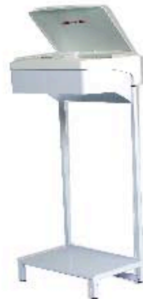
DZTF Sensor Handsfree frame Powder coated white Mains and battery powered, long life/low energy consumption. 5 year warranty Dimensions Open: H: 800 x W: 400 x D: 260mm