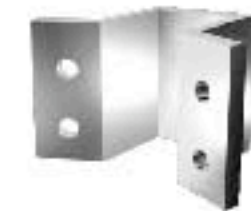
WBM - Wall Mounting Bracket W: 100mm x H: 100mm