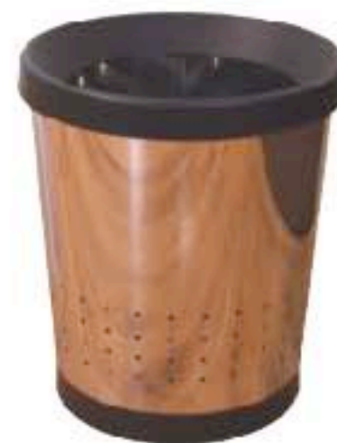
3643 (pack of 2) Polished chrome steel with lift-off top trim. Top D: 260 x H: 310mm Capacity: 12 litres