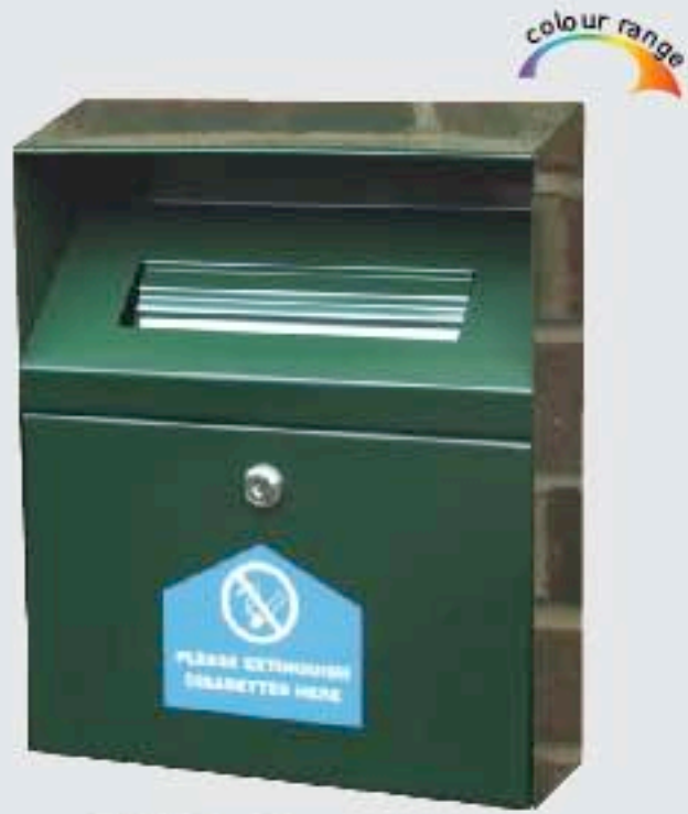
LP100-06 W: 280 x D: 85 x H: 350mm Stock colour: green