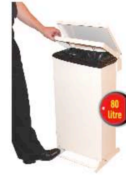
RFG21FP Enclosed sack holder Coated steel construction with hinged sack retention frame. White body with lid colours can be supplied: yellow, black, brown & blue W: 437 x D: 377 x H: 800mm

The RGF model is fully fire retardant and conforms to hospital design regulations. All white will be supplied unless otherwise stated. Other lid colours can be supplied: yellow, black, brown and blue.