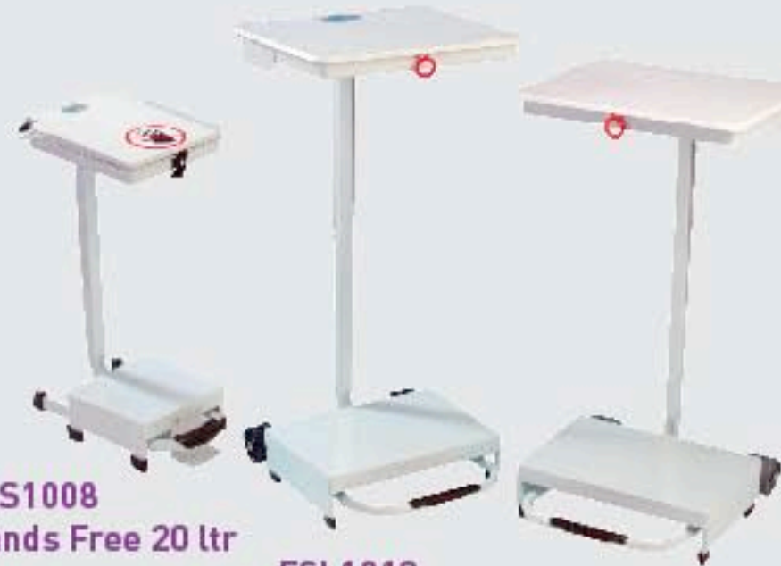
FSS1008 Hands Free 20 ltr