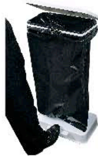
5320 Open sack holder Powder coated steel with sprung clip sack retention ring. Stock colour - white. W: 430 x D: 300 x H: 860mm