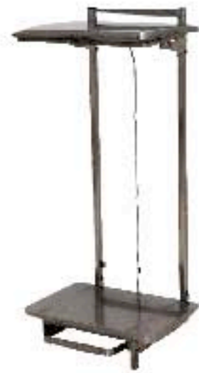
5320SS Open sack holder Stainless steel with sprung clip sack retention spring W: 430 x D: 300 x H: 860mm

Hands free use for general purpose and clinical areas