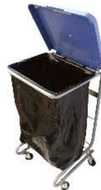
B470 Open sack holder • Tube steel • Sack retention Dimensions H: 900 x W: 470 x D: 500