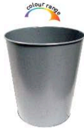
346S (pack of 12) D: 230 x H: 250mm Capacity: 10 litres