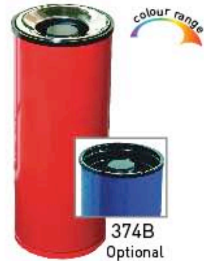
374H ash stand Powder coated Zintec steel body. Black metal ashtray bowl with optional stainless steel insert. D: 250 x H: 600mm 374B (bowl top only) 374H (bowl + insert)