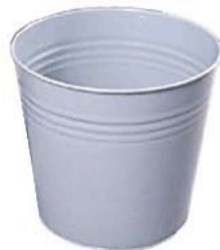
346L (pack of 10) Top D: 295 x H: 275mm Capacity: 15 litres. Grey