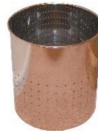
3319 (pack of 4) Polished chrome steel with perforations D: 207 x 250mm Capacity: 7 litres