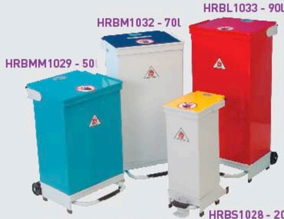
HRBMM1029 - 50L

Fully tested to hospital memorandum 83 (1994) fire safety in health care premises