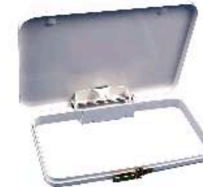
5325 Open sack holder wall mounted Powder coated steel with sprung clip sack retention ring. Stock colour - white. W: 430 x D: 300mm