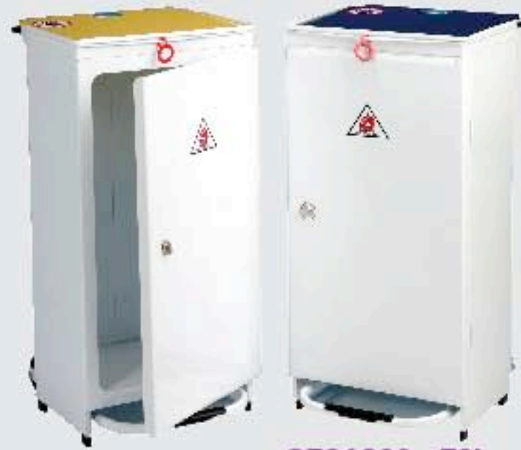
HF0M1037 - 70L SF01022 - 70L