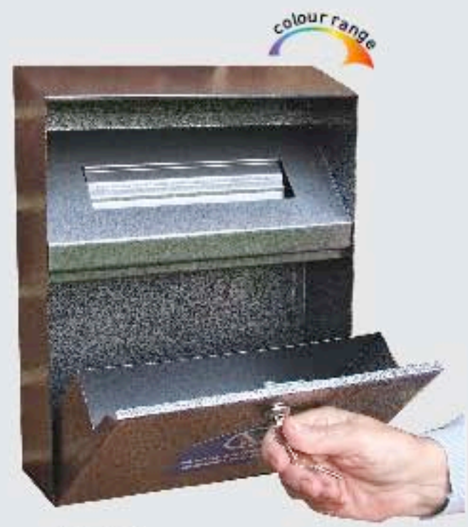
LP104 W: 280 x D: 85 x H: 350mm Stock colour: antique silver

'Linpure' external wall mounted cigarette disposal bins Manufactured from Zintec steel and epoxy powder coated. Integral collection box fitted to the door - cannot get lost. Universal key fits all units. Supplied with fixing kit self adhesive sign to fit on door. LP100-06 & LP104 are available from stock on a next working day delivery. Can be supplied in other colours to order.