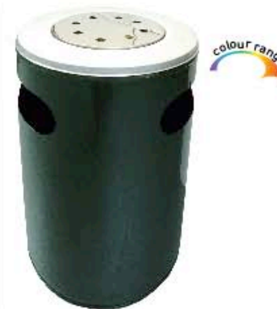
501STC Ash/litter bin Powder coated Zintec steel body. Ashtray top assembly incorporating a black metal bowl with stainless steel top. Three large litter opening. Galvanised liner included. D: 455 x H: 760mm Capacity: 50 litres