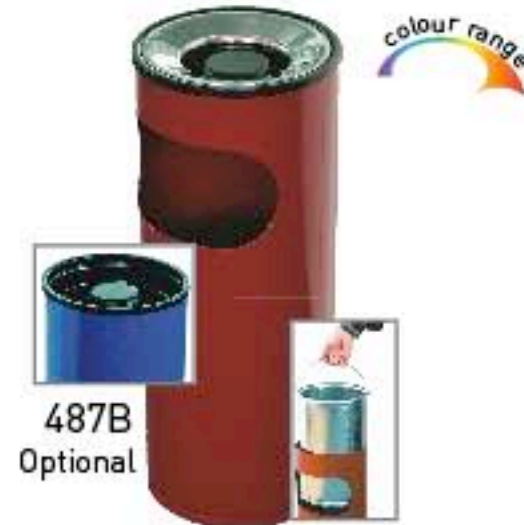
487H ash/litter bin Powder coated Zintec steel body. Black metal ashtray bowl with stainless steel insert. Optional galvanised metal liner. D: 250 x H: 600mm 487H (without liner) 487HL (with liner)