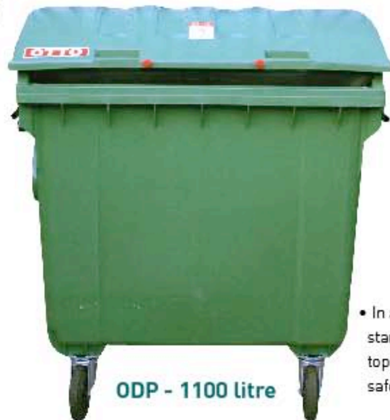
ODP - 1100 litre