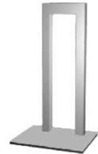
FSDB - Free Standing Double Bracket Floor mounted bolts included W: 300mm x H: 1m