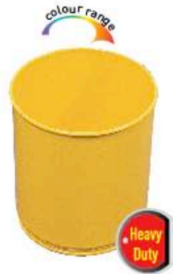
516 (pack of 4) Powder coated for colour options, see page 1 D: 235 x H: 275mm Capacity: 12 litres